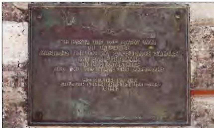
In 1982 a bronze plaque was unveiled at the Belvedere honouring their exploit: 'On the night of May 30, 1941, the patriots Manolis Glezos and Apostolos Santas tore down the flag of the Nazi occupiers from the sacred rock of the Acropolis.'