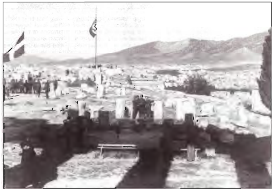
The swastika flag flying from the main flagpole at the Belvedere as seen from the steps of the Parthenon. It took Glezos and Santas several hours to get the flag down, their main problem being to get it past the point where the bracing wires were fixed. Note the Greek flag flying from a shorter mast further to the left. The German occupation authorities allowed this to be flown but due to the fact that it was at a lower height and positioned further away from the Acropolis walls, it could not be seen from all over the city like the German one.