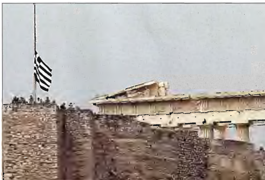
The Greek flag on the Acropolis flying at half-mast in Santas's honour on the day of his funeral.

Manolis Glezos is still a fighting protester today. At 89, in the midst of Greece's worst crisis in modern times, he is as militant as ever. As a proponent of direct democracy and a popular icon, there is a great demand for him to be on the front-line at demonstrations against the austerity measures meted out to Greek society to rein in the country's runaway debt. In March 2010 pictures of the wiry, white-haired activist being tear-gassed by a riot policeman outside the Greek parliament made the national headlines. He puts his present activism in clear words: 'Not since the German occupation have we been in such a difficult and dangerous situation'.