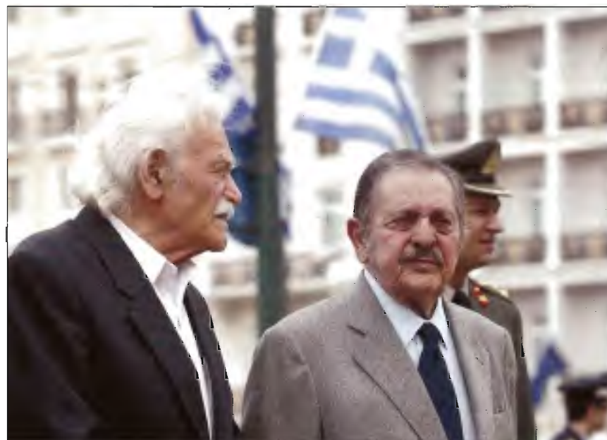
Now generally acknowledged as pioneer heroes of the Resistance, the two men have become household names, known throughout Greece, and no commemoration or celebration connected with the war could be held without their presence. This picture was taken at the Monument of the Unknown Soldier on Platia Syntagma (Constitution Square) in the centre of Athens when they attended the World War II Victory Day commemorations on May 9, 2004.