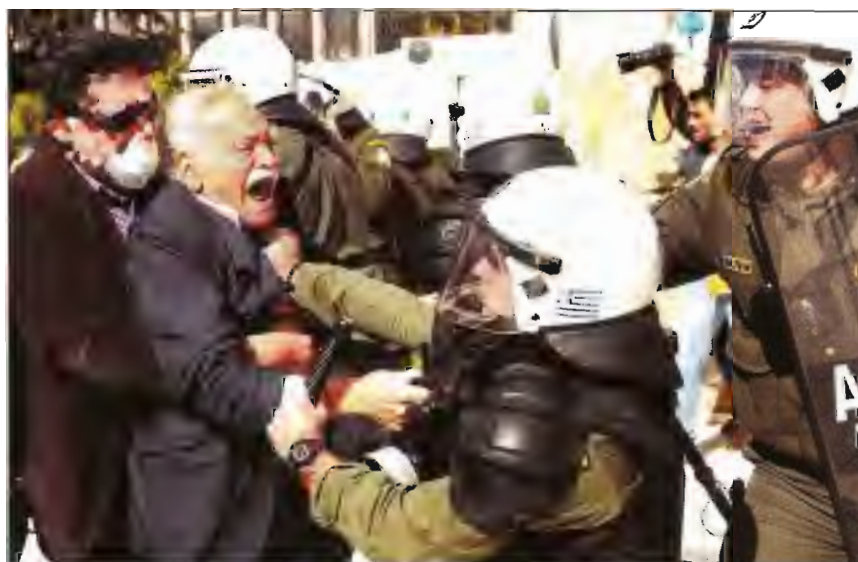
His life-long friend and companion, Manolis Glezos, remains a staunch political activist to this day. Despite his advanced age, he is still in the forefront of many a mass demonstration against the government's strict economic policies. This picture of him being seized by riot police during a mass protest in front of the parliament building on Constitution Square was taken on March 5, 2010. Tear-gassed by the police, 87-year-old Glezos was evacuated in an ambulance with severe respiratory problems, an incident that caused a national uproar.