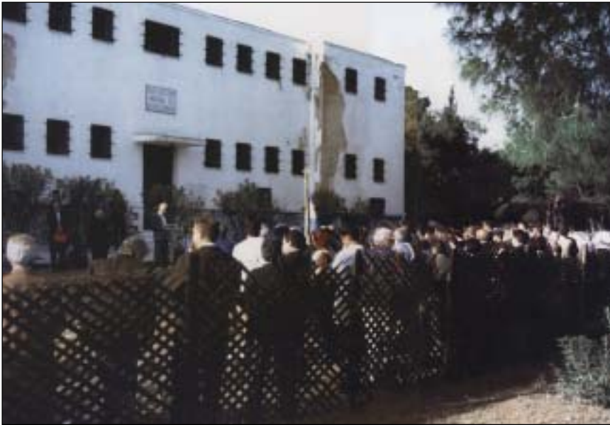
MUNICIPALITY OF CHAIDARI