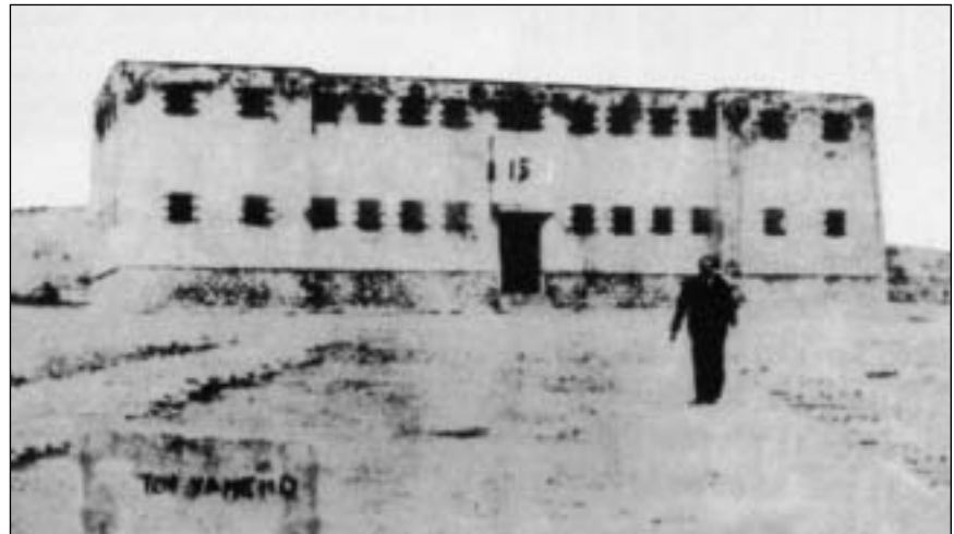
Above: For many years Chaidari remained neglected, all visits being forbidden as it lay within a military base and today only Block 15 survives, formerly used for the solitary confinement of its prisoners.