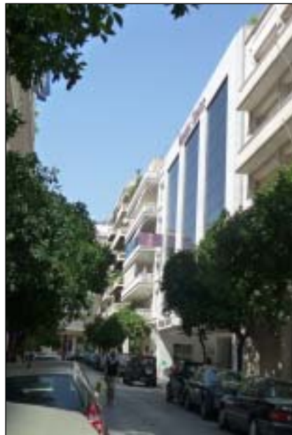
Centre: Today No. 6 Merlin Street in central Athens has been replaced with a modern department store yet one of the original cell doors has been put on display by the entrance as a reminder of the horrors of former days ( right ).