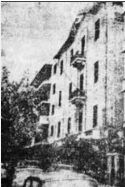
Left: She was taken to the Gestapo headquarters located in Merlin Street where she was subjected to horrendous torture to reveal the names of the other members of her organisation but her interrogators failed to break her indomitable spirit.